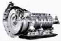
LIFEGUARD TRANSMISSION FLUID